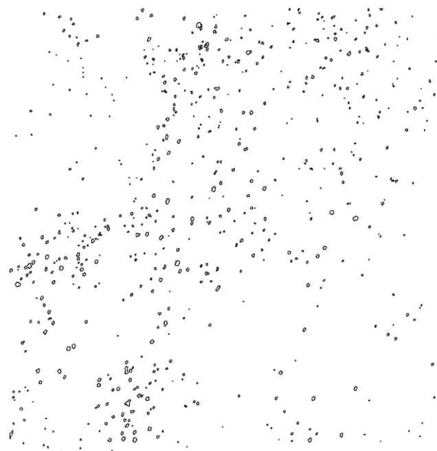
Fig. 1 – Overview of projected tree canopies in Plot 2 during 1940.

We examined whether trees are directly competing with their nearest neighbouring trees. If this is valid then the mean distance to the nearest neighbouring trees should be smaller for dead trees than for living trees. In order to examine the validity of this hypothesis, we summed for each tree present on our two plots, the distance to its four nearest neighbouring trees. Sequentially we divided the sum of the distance to the four nearest neighbouring trees by four, resulting in the average distance to the four nearest neighbours of each tree. We repeated the above described procedure for the dead trees exclusively; thus for each dead tree we summed the distance to its four nearest neighbouring trees (regardless if the nearest trees were dead or alive) and divided it by four. Dead trees were included in the total tree analysis (e.g. trees that died