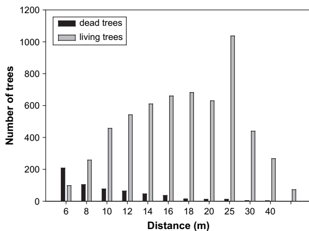
Fig. 3 – Cumulative plot of mean inter-stem distances (in m) to four nearest neighbours of all trees (all plots and years). The first bin starts at 4 m (cf. Fig. 2).

Overall, results from our nearest neighbour analysis indicate that dead trees were on average more closely located to their nearest neighbours than living trees were to their neighbours. Tree individuals compete against other trees for the limiting